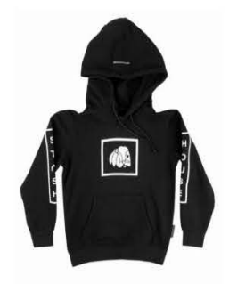
Brand name jumpers