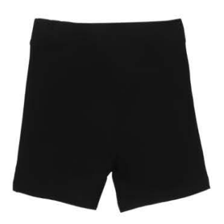
Black bike pants