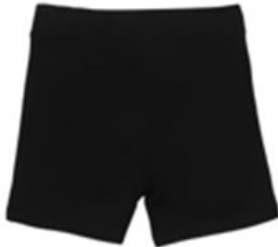
Black bike pants