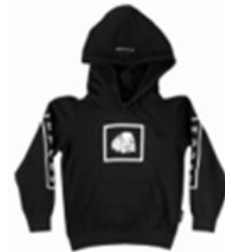
Brand name jumpers