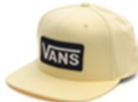
Brand name caps