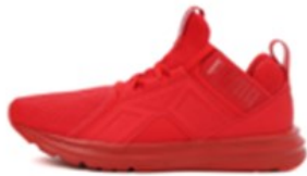
Coloured school shoes

If you are wearing your school uniform you are: