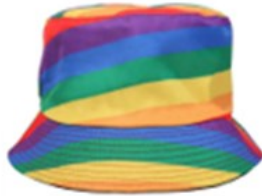
Coloured bucket hats