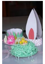
Easter Hat Back Playground Map

Get your creative skills flowing, as our Easter Hat Parade is fast approaching! The Easter Hat Parade will take place on the last day of school for Term 1, Thursday, 1st April . The parade will be held on the back oval, from 12:15pm , and to avoid congestion in these social distancing times, parents will be allocated to certain areas of the back oval, with the students' classes being spread out across the field. See the map below. When you enter, please sign in with the COVID app , from Services NSW, which will be distributed in many areas around the school.