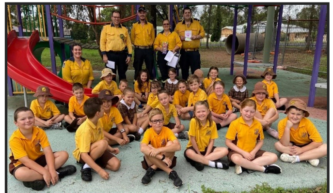
3W with the Darlington Brigade fire fighters